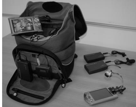
Fig. 2. The equipment in the mobile laboratory used for concurrent verbalisation.