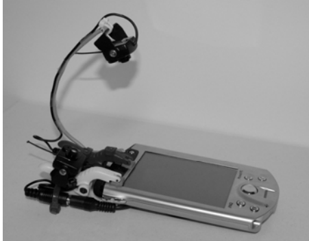
Fig. 1. The small clip-on wireless mobile camera from the mobile laboratory.