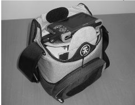
Fig. 3. The mobile laboratory packed up for use.