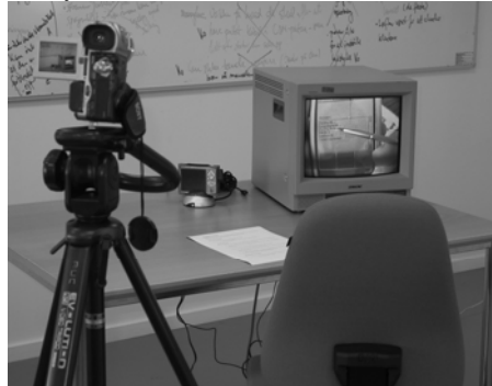
Fig. 4. The setup for retrospective verbalisation.

To support the field evaluation a mobile laboratory was used. It consists of small clip-on wireless mobile cameras (see figure 1), wireless microphones and a mobile digital video recorder. To run it all, it furthermore requires various types of batteries and receivers for the wireless technology. Only the camera and microphone are carried by the participant, the rest is carried by the test monitor packed in a small bag (see figure 2 and 3).